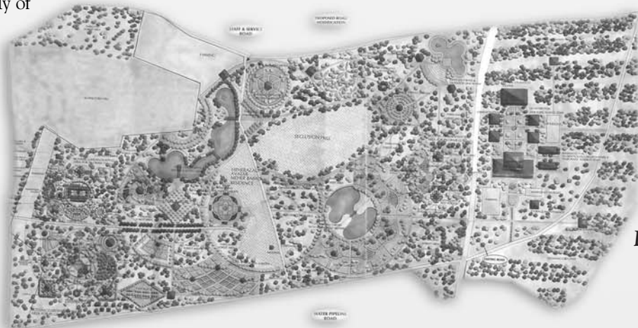
SITE PLAN SHOWING HOW MEHERAZAD MIGHT LOOK IN 50 YEARS

For now, the Plan has no timetable. Present efforts are concentrated on purchasing the essential lands, which will total something like 500 acres. Now and in the future, Meherazad needs workers in residence with skills in various departments. Staff accommodation for eight persons have already been constructed and are ready for use. More staff quarters and related facilities will be constructed in Outer Meherazad in due course.