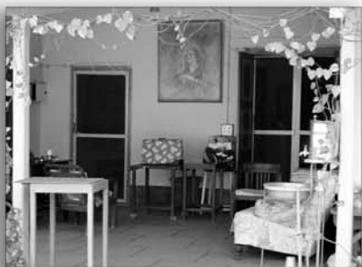
COTTAGE ON WOMEN'S SIDE

WOMEN'S SIDE. Originally Meherazad had four structures, only a bungalow (now the small cottage), two cabins (later Aloba's and Pendu's rooms), and a storage room (the "rice go-down"). In August 1948 construction of the main house was completed, and Baba moved into His room upstairs. Later, Baba shifted to the ground floor. The women mandali occupied other rooms in the main bungalow and cottage nearby. A watchman from the men's side kept awake in Baba's room each night.