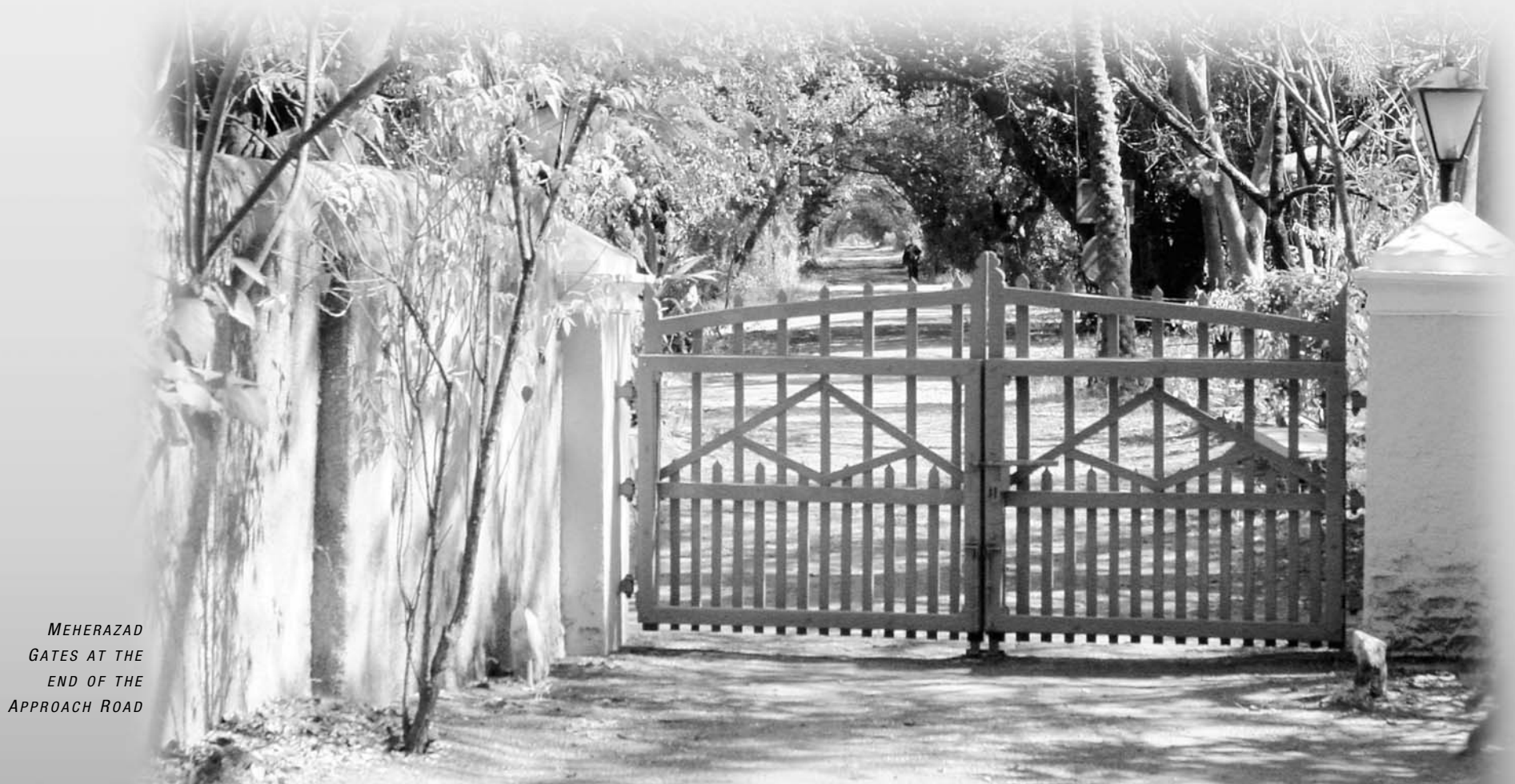
MEHERAZAD GATES AT THE END OF THE APPROACH ROAD