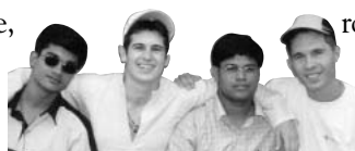
New friendships formed