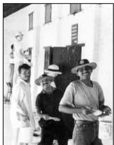
Whitewashing Mandali Hall

At present, plans are under way for a second Young Adult Sahavas, which is scheduled for 26th June through 3rd July 2002. The size of the gathering will be expanded to 100 participants, 50 from India and 50 from abroad; the age limits are for persons between 19 and 30 years old. Those seeking further information or application forms should write to Meherabad Young Adult Sahavas, care of the Avatar Meher Baba Trust, or address e-mails to sahavas@ambppct.org .