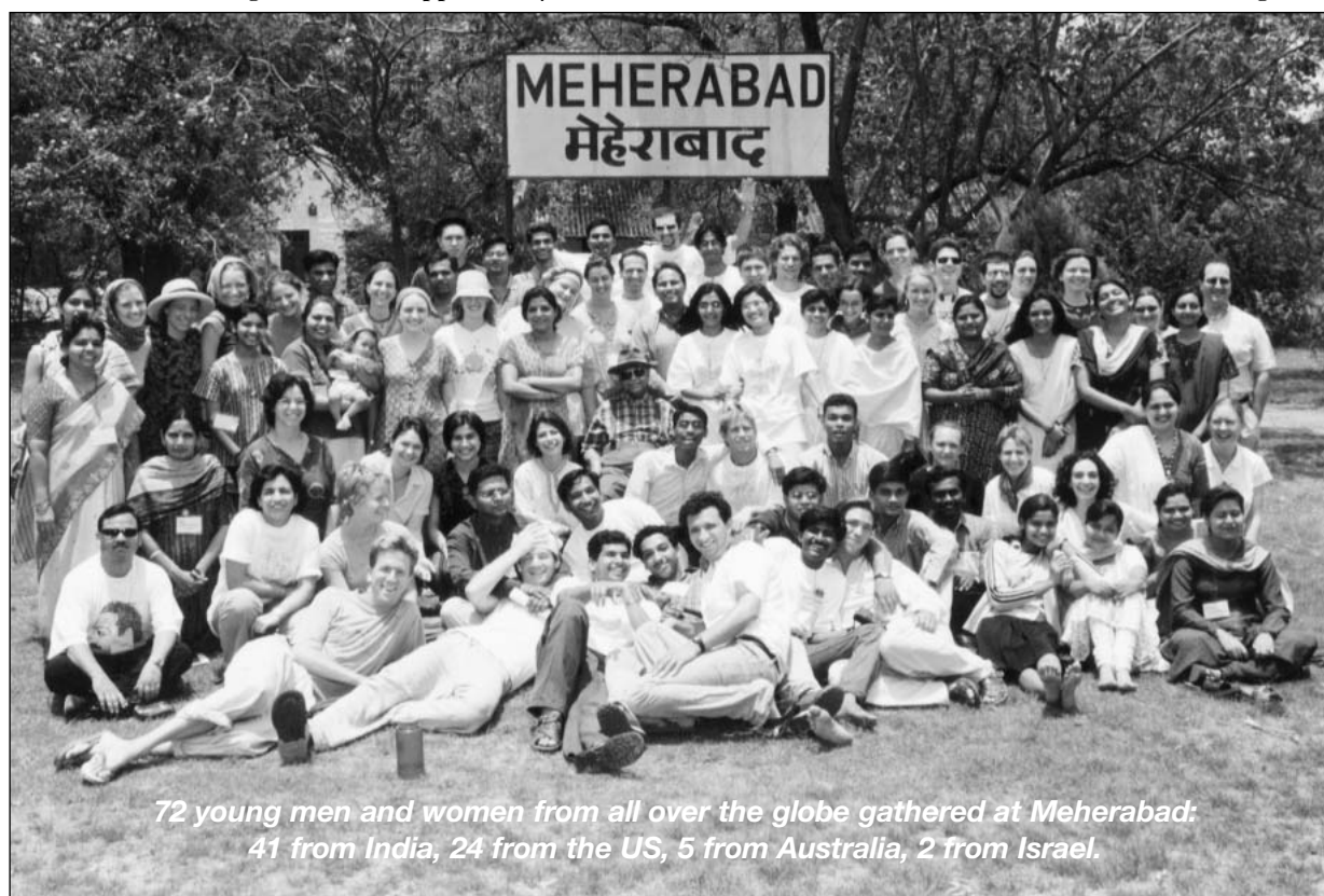
72 young men and women from all over the globe gathered at Meherabad: 41 from India, 24 from the US, 5 from Australia, 2 from Israel.