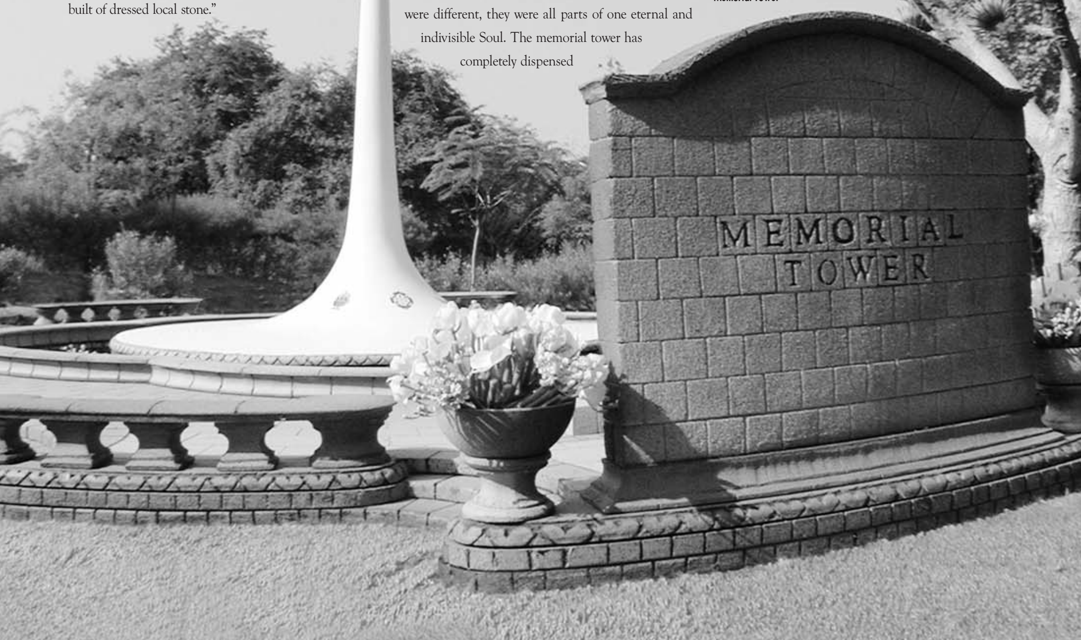
Model of the Memorial Tower