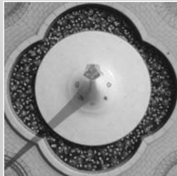
Names inscribed on the base of the Tower, viewed from above