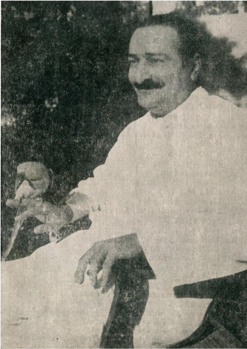
AVATAR MEHER BABA