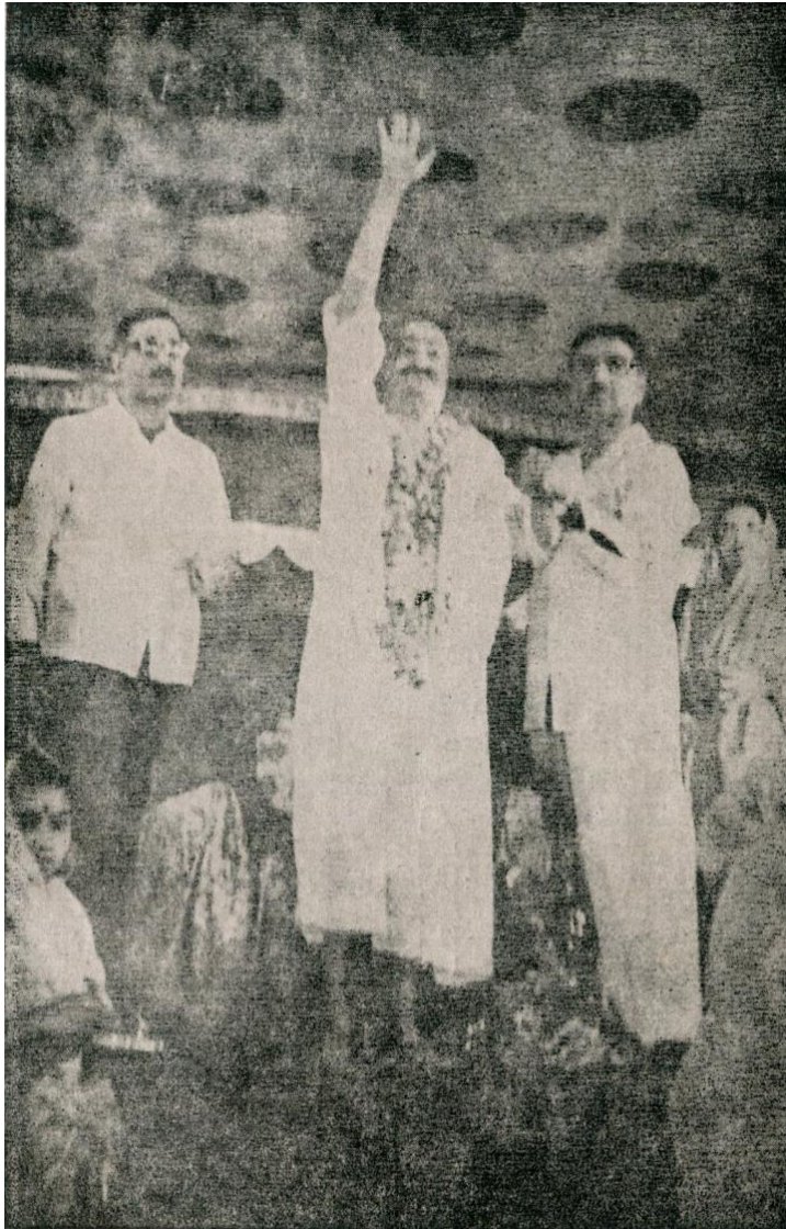
AVATAR MEHER BABA

(giving His Last Darshan at Guruprasad, Poona from 2nd to 4th May 1965)