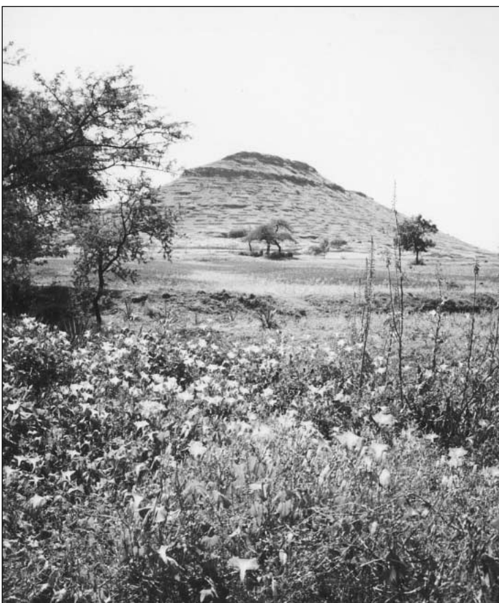
Seclusion Hill, Meherazad.

while Meherazad is the abode of silence. Thus in future years Meherabad will host the burgeoning of art and culture, education, medical services, and above all, the masses of pilgrims seeking darshan at His Samadhi. Meherazad will remain a garden fragrant with His presence, where visitors can taste and savor the wine of His divine humanity.