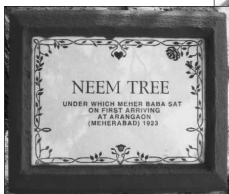
Beautifully designed historical markers such as shown here now document key sites such as Meherabad.

THE 1999 MONSOON started with a rush in late May and early June, lapsed into a long lull, and concluded with a splash in exceptional late-September and early-October downpours. Through the end of October, the ten-month Meherabad total of 28 inches exceeded the annual average by a wide margin. Ample water supply for pilgrim and estate needs is now confidently anticipated for at least the next year.