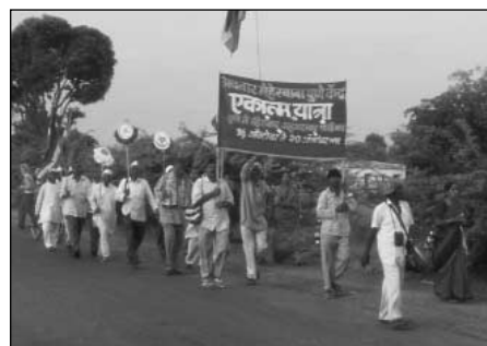
New Life pilgrims arriving at Meherabad.

grimage on foot - to Baba's Samadhi. Four days and 75 miles later, 214 footsore but exuberant pilgrims arrived at Meherabad in time for evening arti. Recent years have witnessed a growing