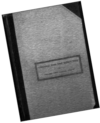
The cover of "Tiffin Talks."

A group of manuscripts dating from the 1920s have recently come to light and are currently being edited for publication. Some of this material has been published before, but most of it is new.