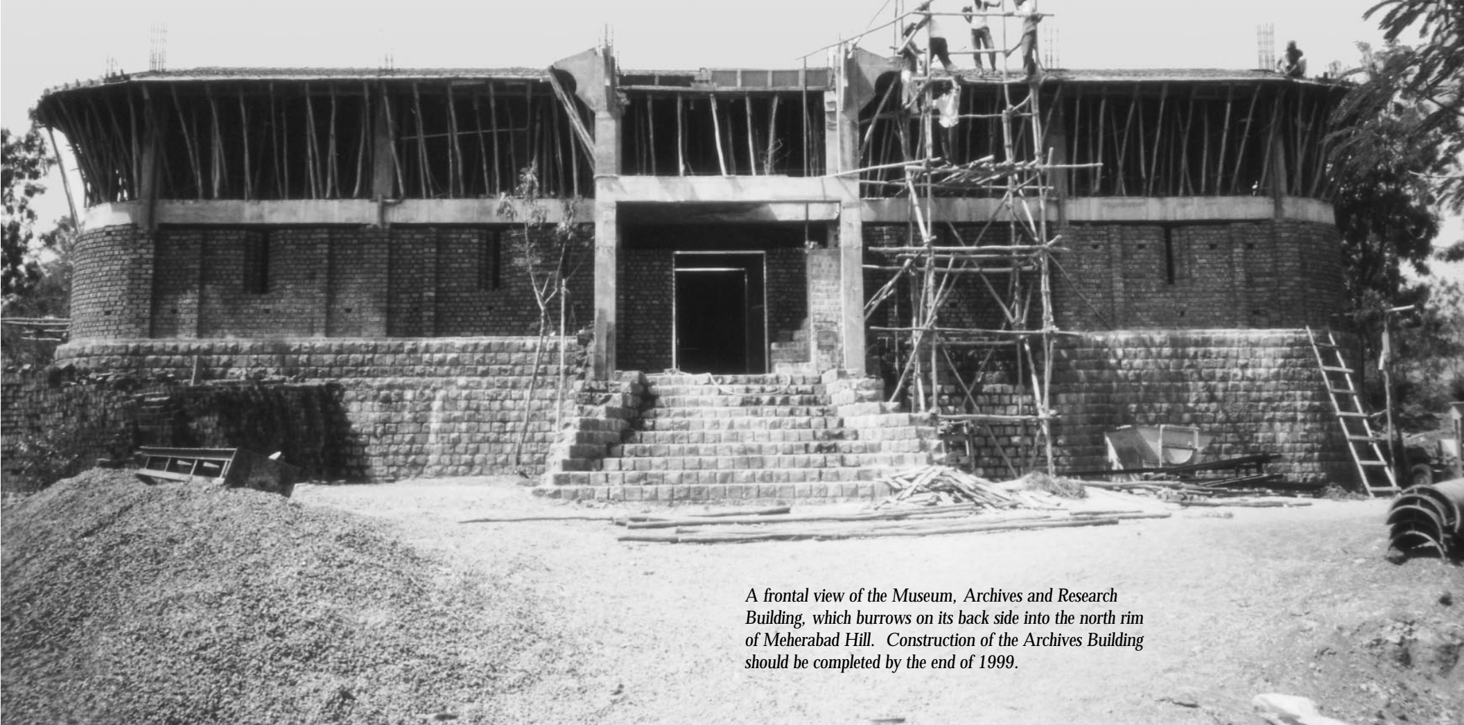
A frontal view of the Museum, Archives and Research Building, which burrows on its back side into the north rim of Meherabad Hill. Construction of the Archives Building should be completed by the end of 1999.

Now, two years later, construction is still proceeding on schedule. The building itself should be completed by the end of 1999. As of the present, the frame has been erected, the concrete roof poured, and the brick walls laid up to the top of the ground floor level. A large structure built on an 85 by 75 foot plinth with a 50 by 50 foot extension, the Archives Building has been designed like a thermos bottle — a box within a box — with double walls and a double roof. The underlying principle here is passive climate control: that is, the design of the building itself mitigates against extremes of humidity and temperature. In this way, dependency on air