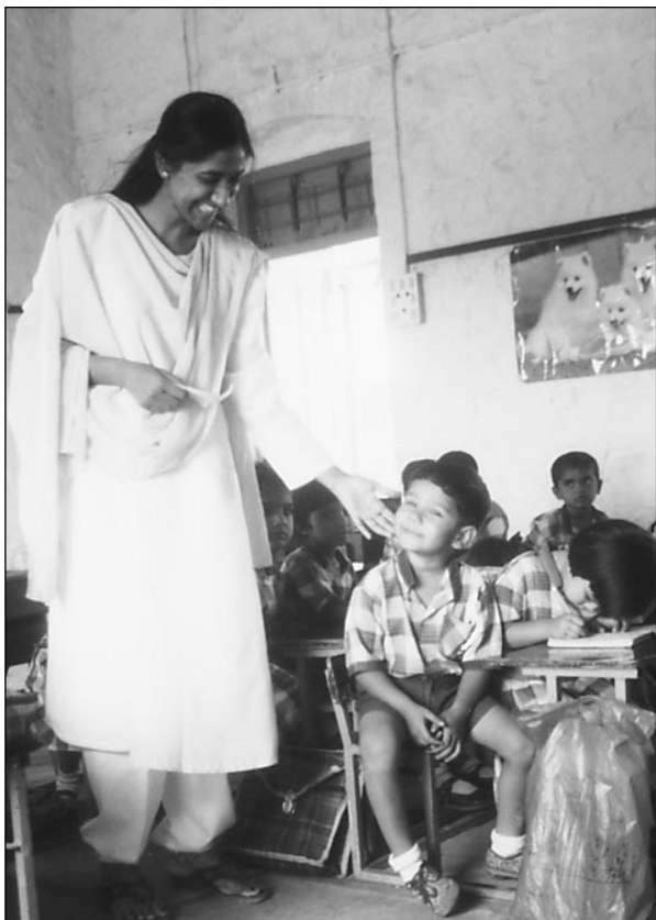
A class in the Meher English School, most of whose 287 students in kindergarten through the tenth standard hail from Arangaon, the village on the south border of the Trust Estate.

Another major Trust activity in the educational sphere is the Meher English School, which this past April completed the thirteenth year of operations from its site in the Education Building on the southeast border of the Trust Estate near Arangaon.