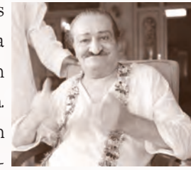
Meher Baba, Guruprasad, November 1962.

Merwan Sheriar Irani, known as Meher Baba, was born in Poona on February 25, 1894, of Persian parents of Zoroastrian faith. He attended a Christian high school in Poona and later Decan College. In 1913, while still in