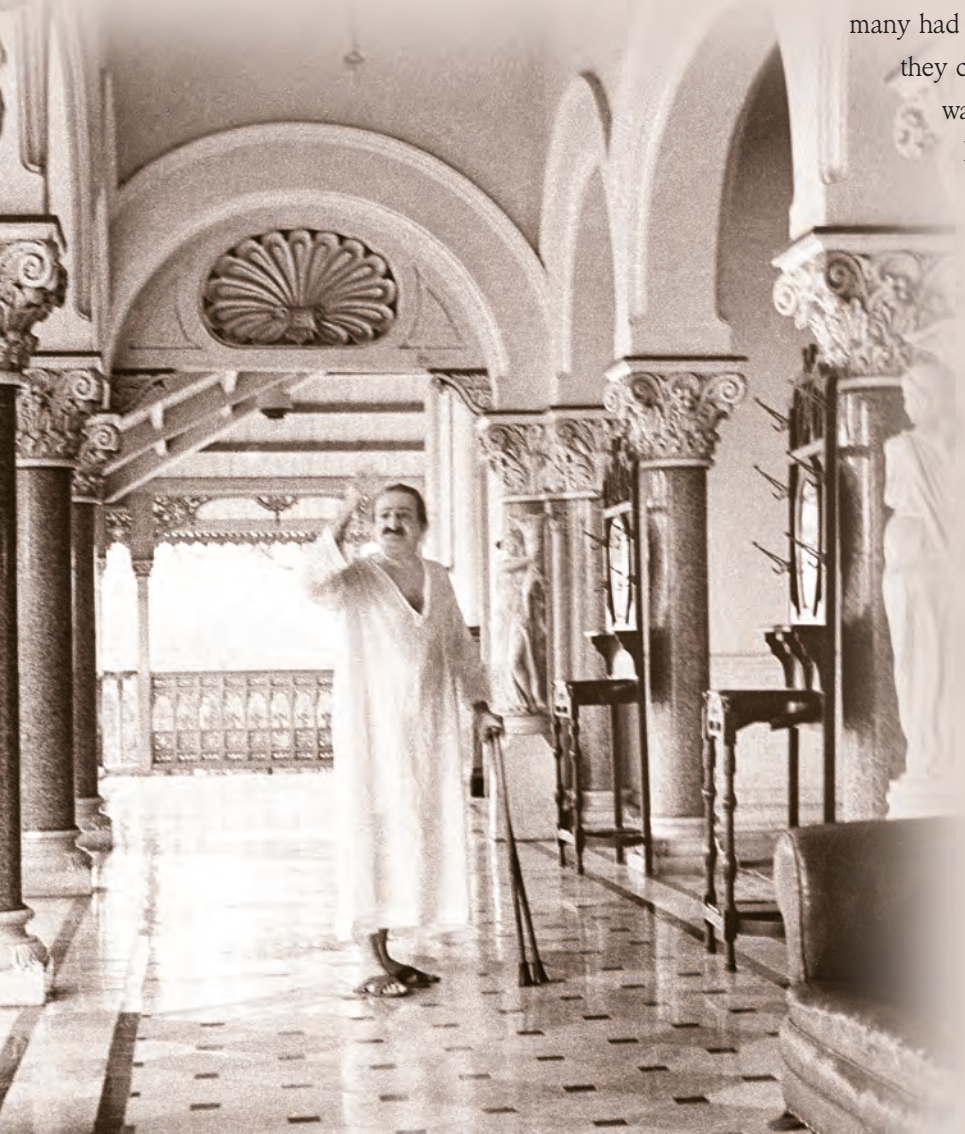
Meher Baba walking in Guruprasad

The chair you see here is the same one on which Meher Baba sat for many darshans and intimate gatherings. It has remained here for His present and future lovers to partake of His darshan.