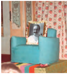
Baba's chair during the 1969 Darshan

Guruprasad—the Guru’s gift—is always special. Today you are standing in a space that was once part of a large palace owned by the Maharani of Baroda, Shantadevi. Avatar of the Age Meher Baba sanctified this